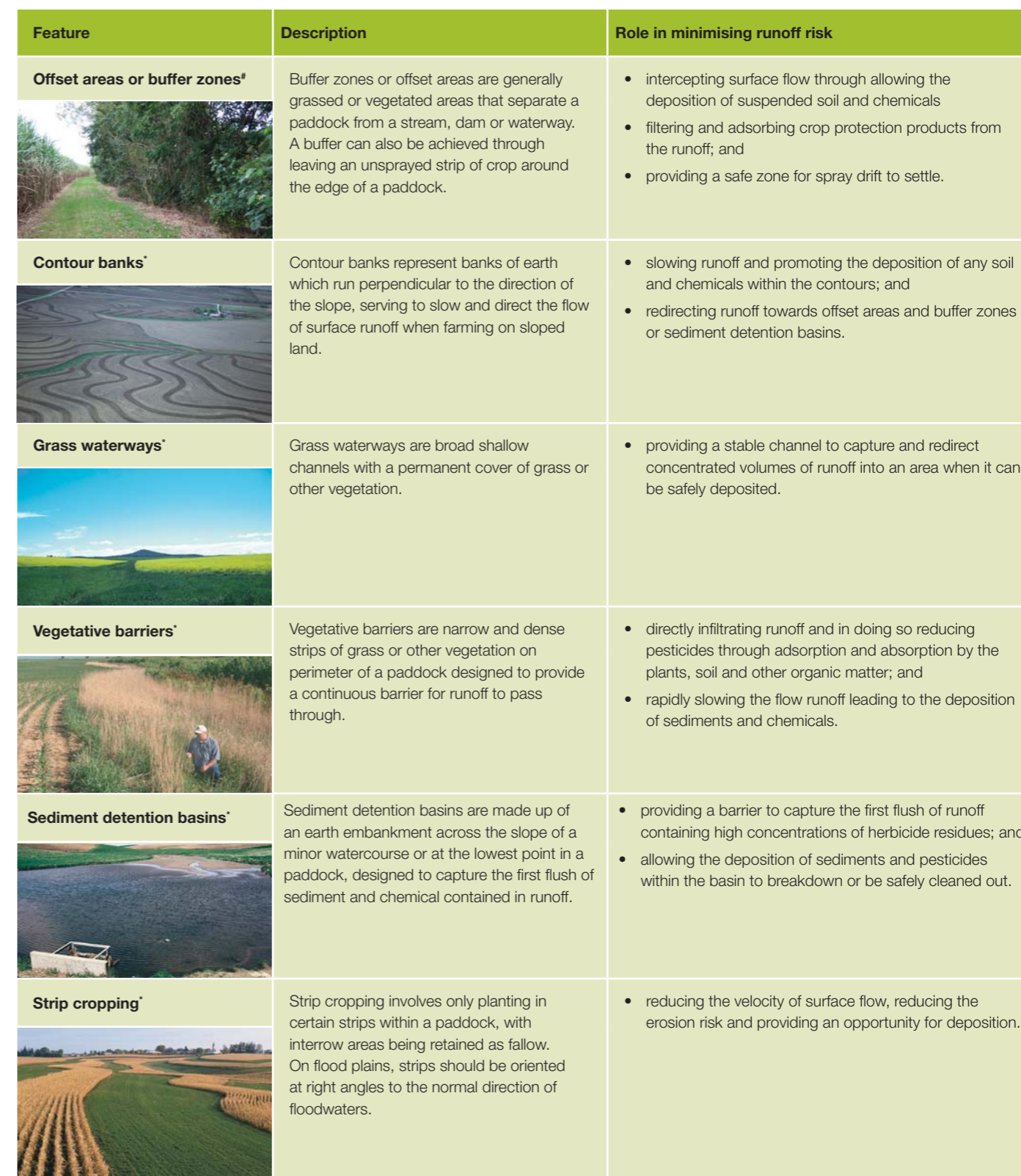
Table 2: Landscape design options to minimise off-target movement of crop protection products (adapted from Rattray et al, 2007)

Table 2 (page 5) outlines a range of landscape design options capable of reducing the risk of sediments, nutrients and crop protection products moving off-target and off-farm in surface runoff.